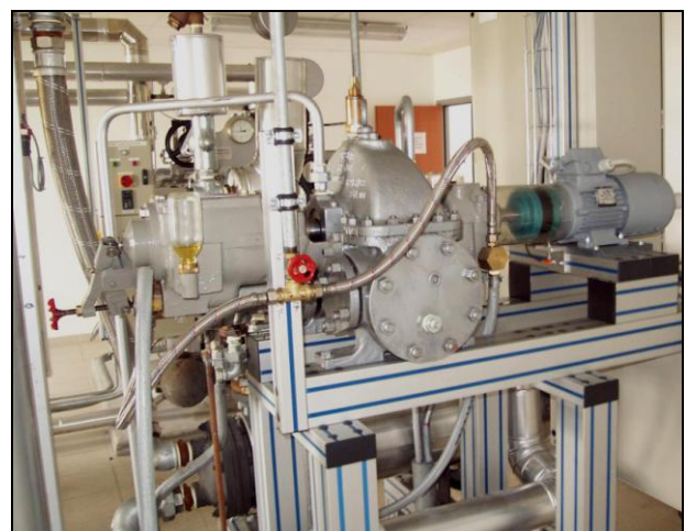
Turbine and alternator