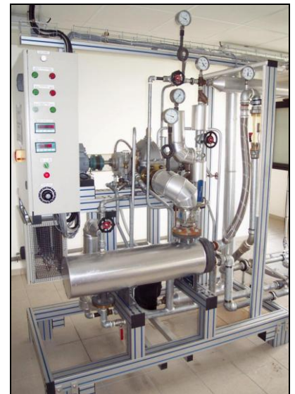
Turbine with condenser