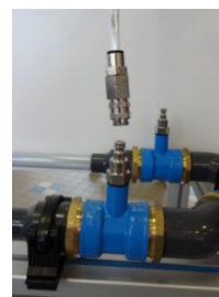
Example self-sealing connectors in stainless steel type STAUBLI

DIDATEC– Zone d'activité du parc – 42490 FRAISSES- FRANCE Tél. +33(0)4.77.10.10.10 – Fax+33(0)4.77.61.56.49 – www.didatec-technologie.com email : service_commercial@didatec-technologie.com